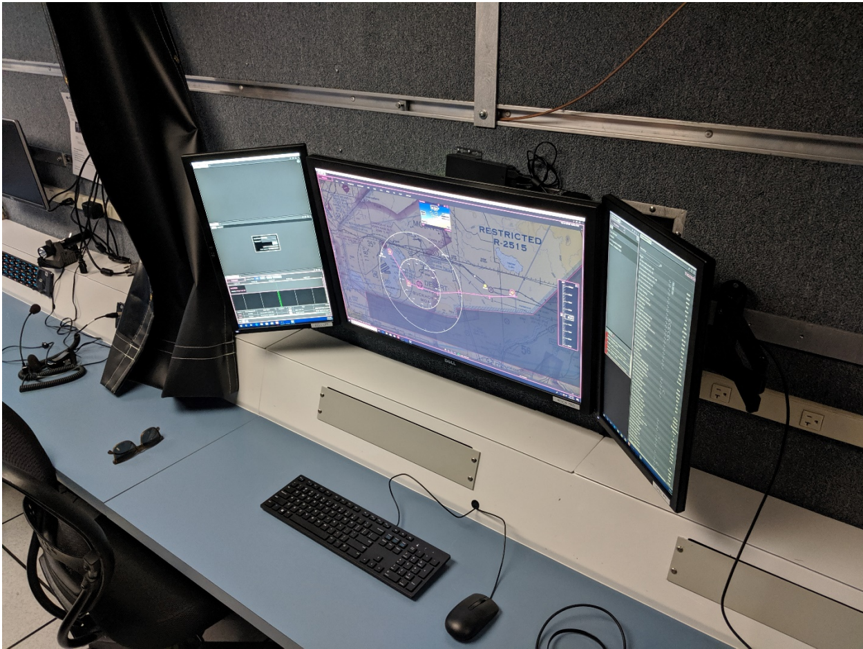
Figure 2.4.2.2-1: The Vigilant Spirit Control Station control interface located within the Mobile Operations Facility 5 Research Ground Control Station.